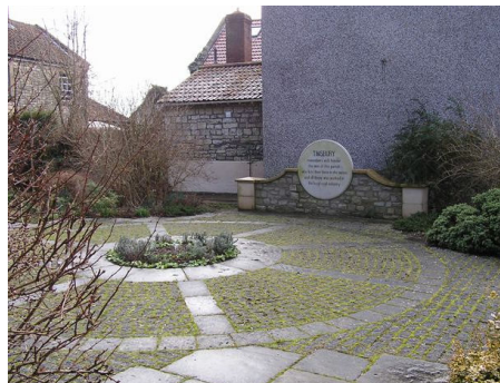
Miners' Memorial Garden

The Miners' Memorial Garden was erected in memory of the 7 miners who lost their lives on the 6th Feb 1895 in the Timsbury Mine Disaster.